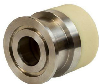
H1 KF-40 Sensor Housing

User Selectable Ranges (Pre-Configured): 0 - 10ppm/100/1000ppm/1%/5%/10%/25%/100% Digital Push Buttons to Perform Local Span Cal Sensor Housings: H1 KF-40 or H3 Flow Through Graphical Display with Backlight Many additional customized options available Integral Span Pot to Adjust 4mA Offset