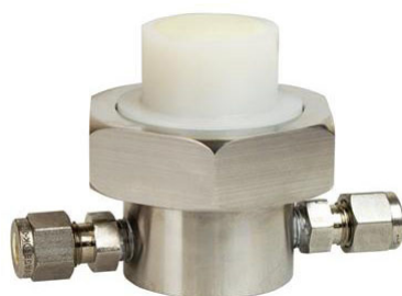
H3 Flow Throw Sensor Housing